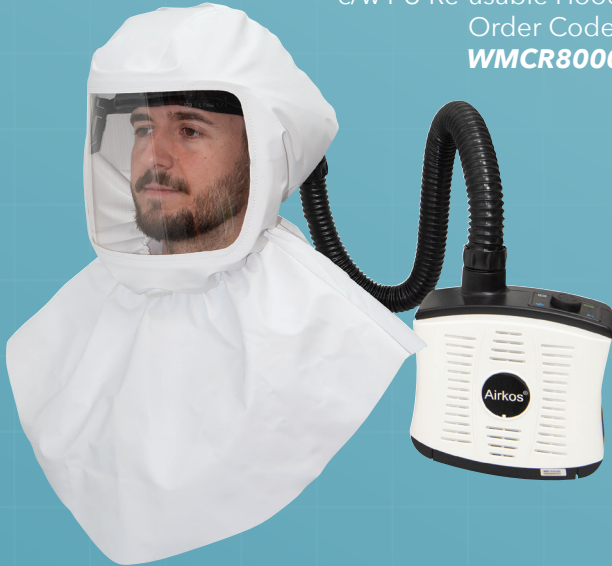
Weltek Medical System c/w PU Re-usable Hood Order Code: WMCR8000