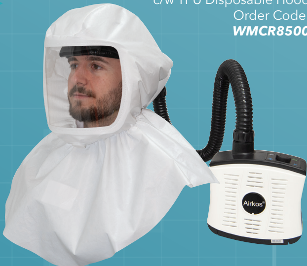
Weltek Medical System c/w TPU Disposable Hood Order Code: WMCR8500