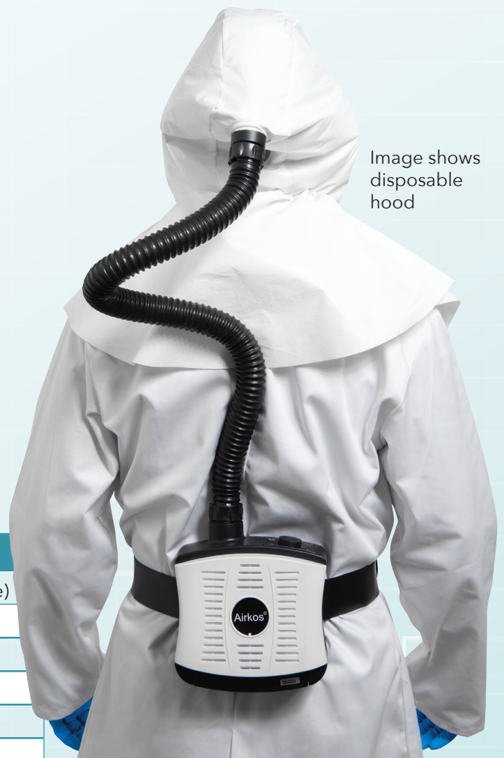
Image shows disposable hood

Against multiple hazards protecting the head, face, eyes and ears from exposure to hazardous chemical waste.