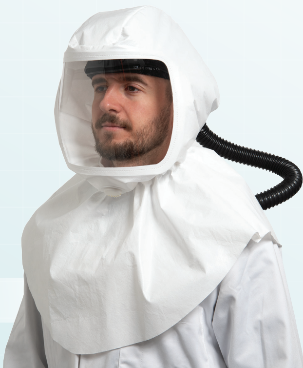
Image shows re-usable hood

Available in 2 systems both featuring the Airkos® Blower Unit but with a choice of hood. The Softek hood is a flexible headtop in re-usable (PU) material or disposable (TPU) material. The Softek hood is equipped with adjustable headgear in width, height and angle for perfect ergonomics as well as a front air duct for a smaller airflow inside.